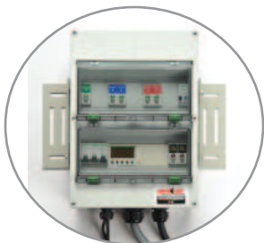
Circuit Control Panel