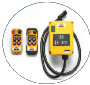
Optional Wireless Remote